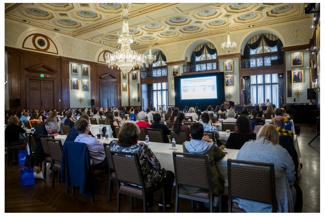
Attendees\ at\ the\ 2022\ conference